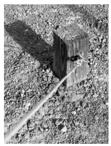
GUY WIRE FIX 2