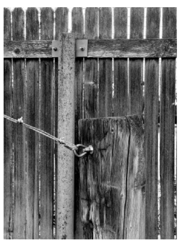
GUY WIRE FIX 1